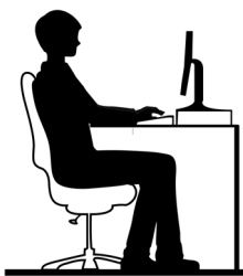
Reclined propped position for keyboarding

The above diagram shows the “elbow floating position” for keyboarding, where your elbows are beside your body but unsupported. A variation on this which can assist in reducing neck tension is the “reclined propped position” where you move the keyboard further away from you and support the forearms along the desk. You may need to slightly reduce the height of the chair for this position to ensure you stay supported in your seat.